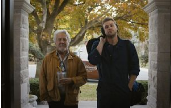
Spotlight, Presented by Audible: View Films

The Spotlight program is a tribute to the cinema we love, presenting films that have played throughout the world.