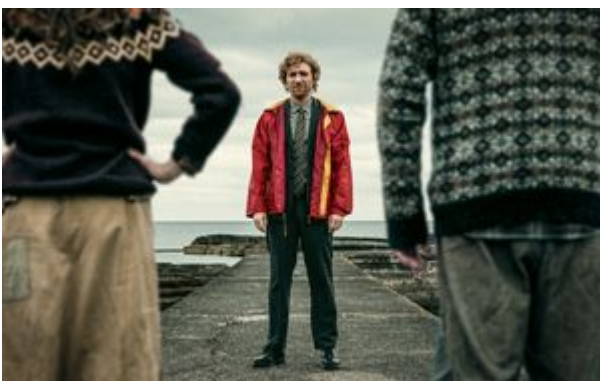
NEXT: View Films

These nonfiction feature films from emerging talent around the world showcase some of the most courageous and extraordinary filmmaking today.