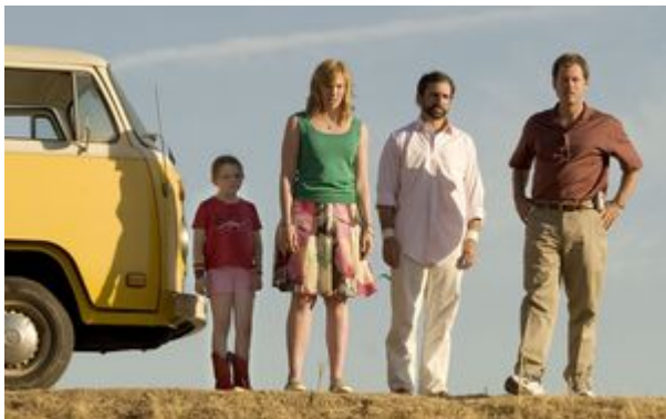
Park City Legacy: View Films

For over a decade, the Family Matinee section of the Festival (formerly known as KIDS) has been built for audiences of all ages, but especially for our youngest independent film fans.