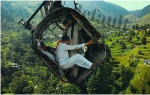
World Cinema Documentary Competition: View Films

These narrative feature films from emerging talent around the world offer fresh perspectives and inventive styles.