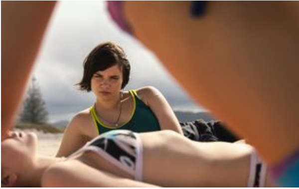
World Cinema Dramatic Competition: View Films

These narrative feature films from emerging talent around the world offer fresh perspectives and inventive styles.