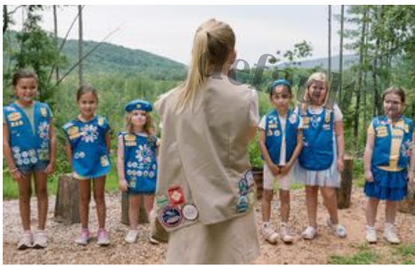
Family Matinee: View Films

The Spotlight program is a tribute to the cinema we love, presenting films that have played throughout the world.